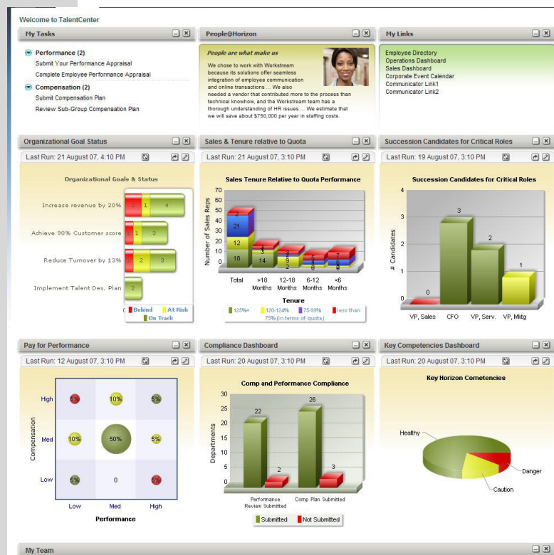
The TalentCenter 7.0 Personal Workspace